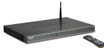
DSM-520 Wireless HD Media Player

Other D-Link products that work with the DSM-520: